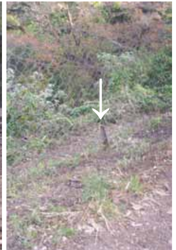
Sawed off fence post indicated by arrow