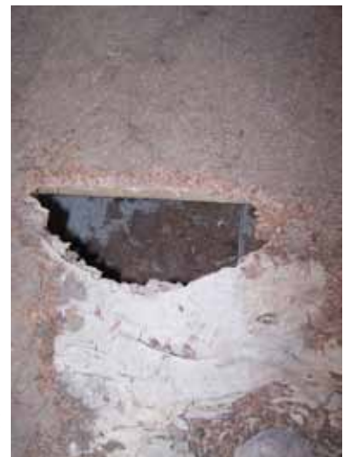
Girls dormitory termite damage of flooring