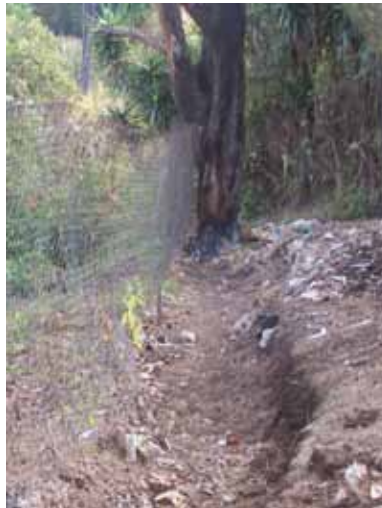
Fifty feet of fence with fence posts stolen

We have 34 students enrolled in the Bible school, studying, evangelizing and working in preparation for the ministry. The radio ministry continues to reach people. The churches are doing well. We are promoting the Bible school in several countries this spring. We appreciate all of the prayers and financial support that keep it all going.