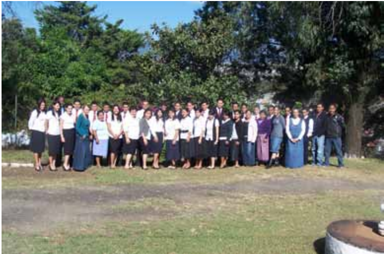
Thirty of thirty four students and acting staff for summer semester 2012

In the last 5 months our chain link fence has been cut 6 times, and items stolen, mostly metal things that could be recycled. More recently (Jan. 26 th ) the thieves cut and removed several of the poles in the fence. We have had to replace and work on the front gate/door lock several times because they have attempted a forced entrance at this place. So far no one has been assaulted or injured, and the things taken don't amount to much monetarily. For this we are grateful. Repairing the damage has taken time and a little money, but mostly just the hassle of dealing with it.